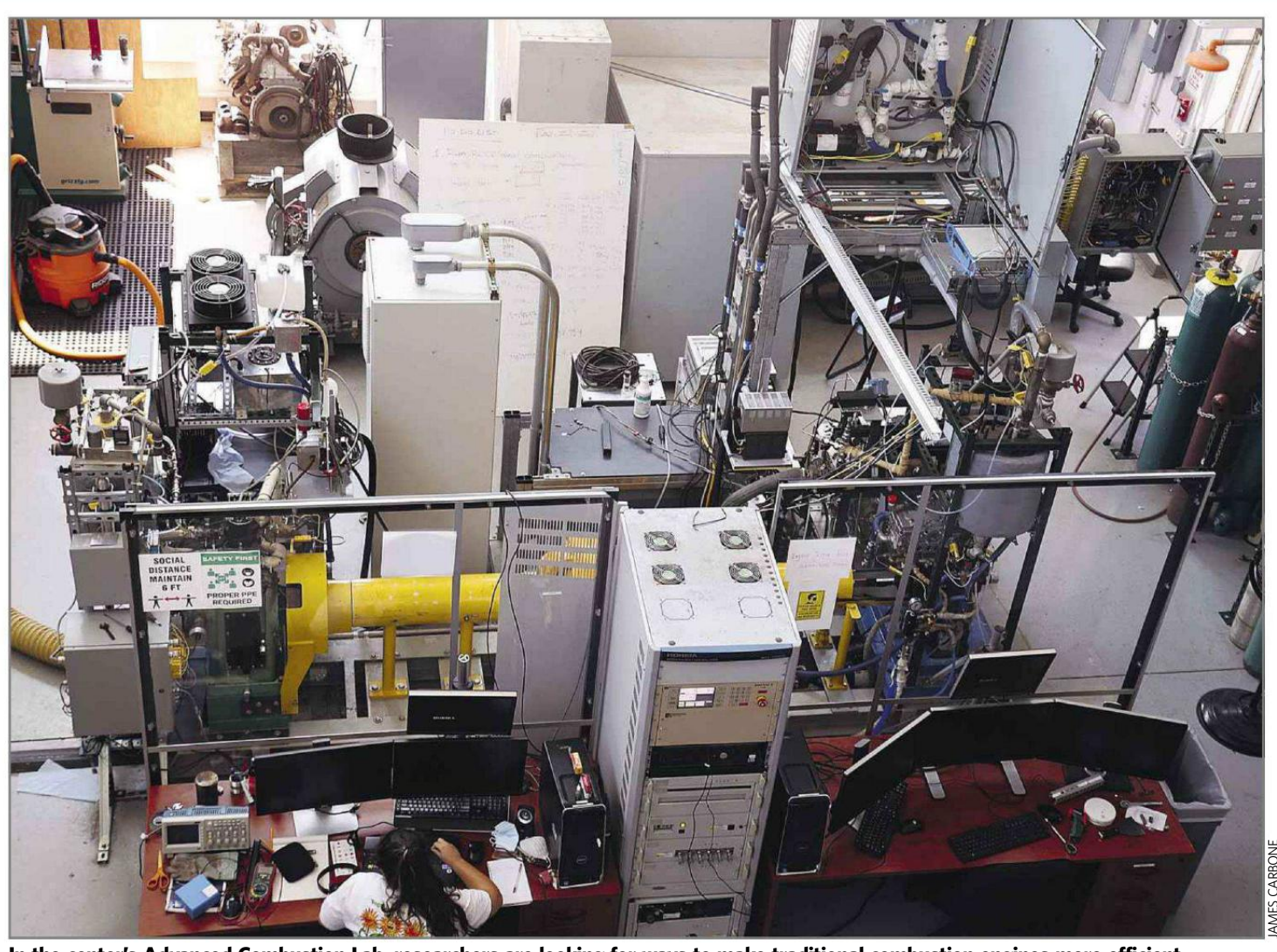
In the center's Advanced Combustion Lab, researchers are looking for ways to make traditional combustion engines more efficient.

ucts at the center are achieving breakthroughs, and some are moving on to wider commercialization.