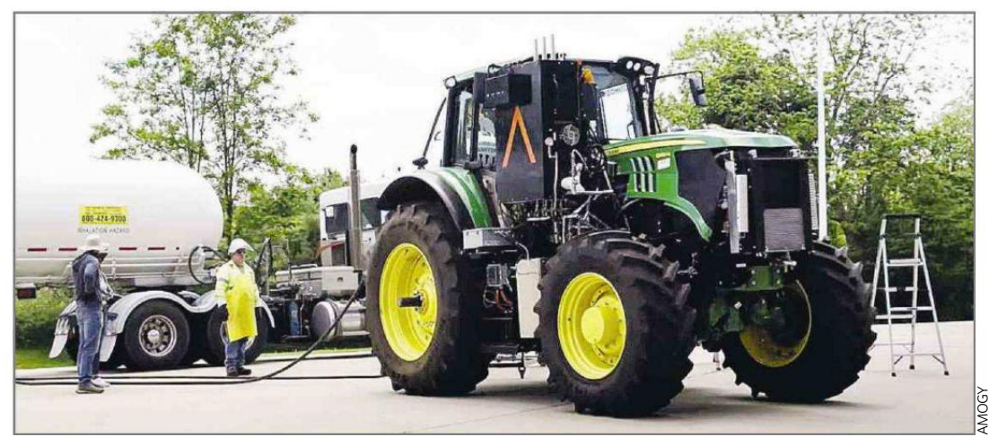
Amogy, a startup that developed a process for deriving hydrogen from ammonia, worked with Unique Technical Services, another startup at the center, to create this ammonia-powered tractor.

safer and longer-lasting, while allowing cars to charge even faster than today's superfast chargers (which recharge batteries in an hour or less). There's also much interest in advancing large utility-scale batteries to help in the transformation of the electric grid.